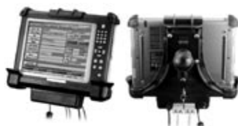
Vehicle Mounting Enclosure