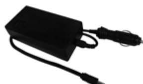
Car Adapter, Hand Strap & Shoulder Bag