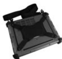
Hand Strap & Shoulder Bag