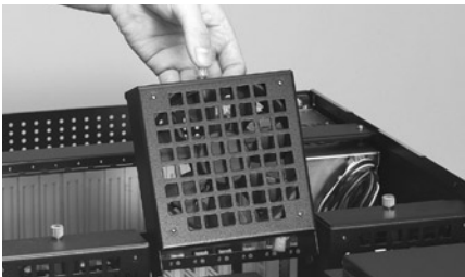
Built-in hot-swap fans