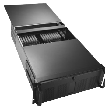
Dual top cover design for easy maintenance