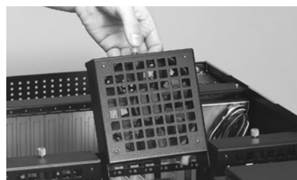
Built-in hot-swap fans